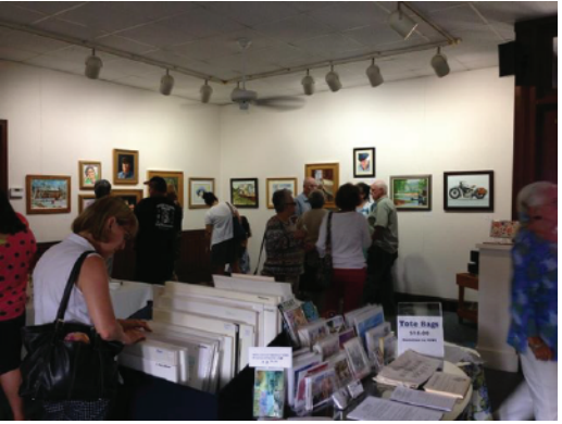
September Opening Reception