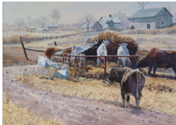
“Zoo Animals Feeding” Kris Occhino

Animals (domestic or wild), waterfowl, and birds are fun to paint. The instructor will demonstrate techniques for sketching and painting wildlife and for creating the textures of fur, feathers, etc. Students will be shown a variety of design ideas for backgrounds that will help to highlight their wildlife images. Some of the photographic images needed for assignments will be provided. Students should start collecting photos of wildlife for others.