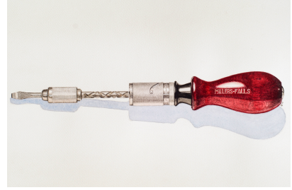
Honrable Mention 2 "Crewed No. 29" by Geoffery Gavett