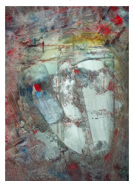
Honrable Mention 4 "Washed Up" by Jane Brito