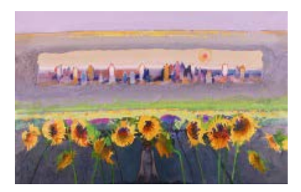
"Pilgrimage with Sunflowers" Stephen Quiller

Sign Up Deadline: March 28th Space is limited to 10 students a day Monotypes are paintings done on a prepared Plexiglas plate using watercolor, oil or printing inks. A damp piece of paper is placed over the plate and put under pressure through a print press. The pressure forces the image to be transferred from the plate to the paper (in reverse). The plate sometimes retains a very light image of the design and a second (ghost) image can be pulled. The artist can then choose to add more paint to revise the design, paint directly on the monotype with pencils, pastels, etc. or clean the plate and develop a new image.