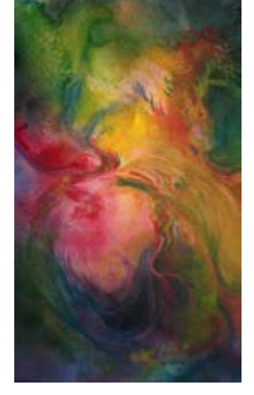
Inner Space, Looking Within Myself by Elinor Thompson