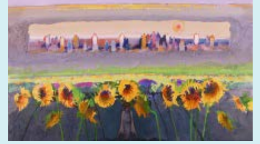
"Pilgrimage with Sunflowers" Stephen Quiller