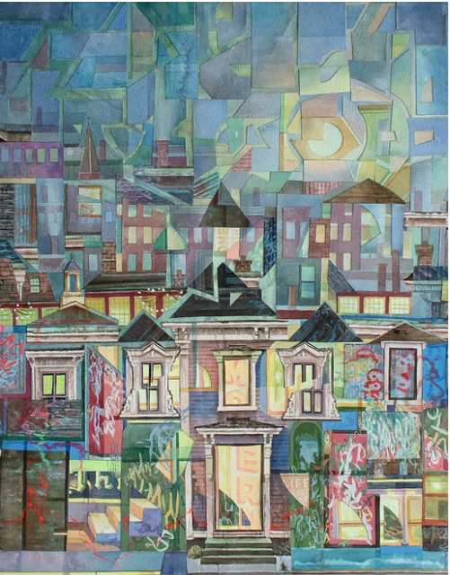
Second Place: City Lights , Becky Haletky