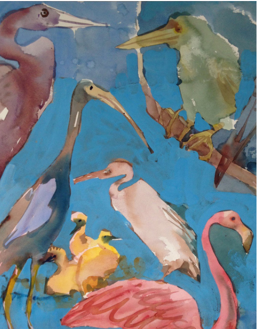
Third Place: Boids , Cathy Chin