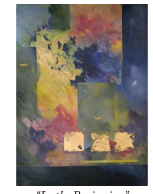
"In the Beginning"