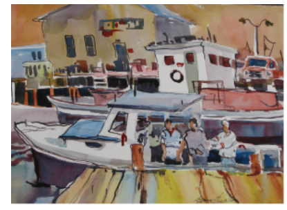
"Docked Boats" by Lavonne Suwalsk

"Go Figure!" Open Juried Show (All 2D Media & Collage) Juror: Paul Leveille