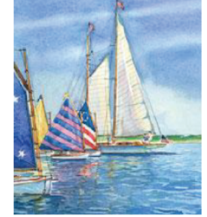
"Rainbow Fleet, Nantucket"