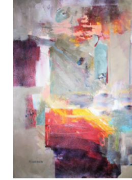
"Points of Interest"