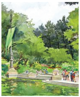
"Bethesda Terrace, Central Park NYC"