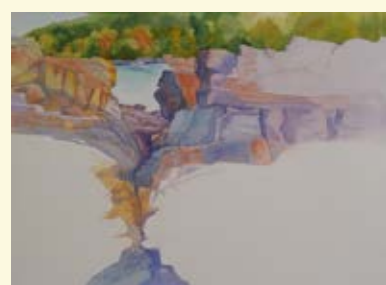
"Sneak Peak" Kris Occhino