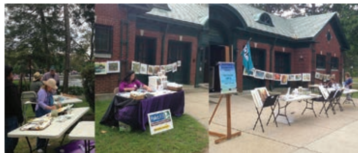
RIWS members painting at the Pawtucket Fall Arts Festival, selling artwork and spreading the word about the society.