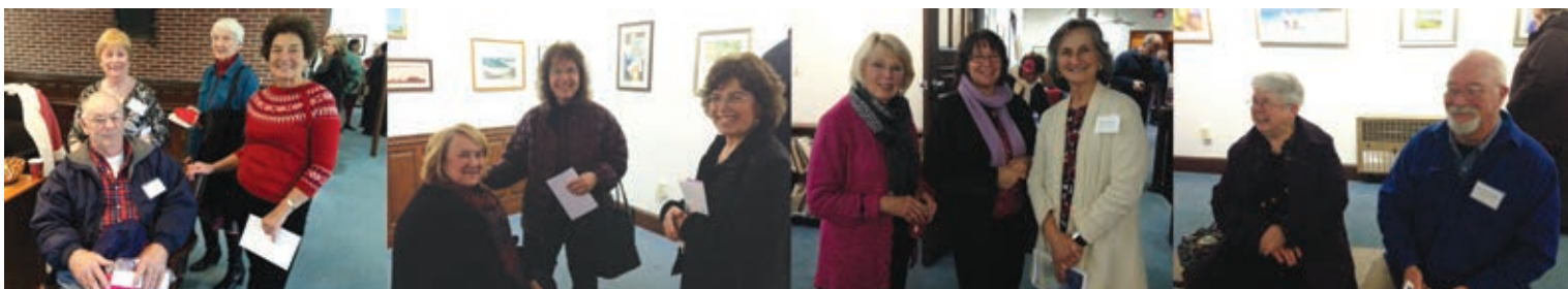
Photos from the opening reception of the New Artist and Signature Member Exhibition

NONPROFIT ORGANIZATION US POSTAGE PAID PAWTUCKET, RI PERMIT #104 ADDRESS SERVICE REQUESTED