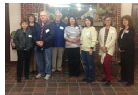
Some of our new Artist & new Signature members at the opening reception.