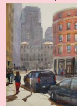
"Red Pants" Bill Lane

If you want to chat about watercolors, painting, scuba diving, cycling and/or swimming, let's talk! 401.529.3504 or bill@lanedesign.com