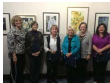
White & Abstraction Award Winners