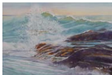
"Morning Drama" Kris Occhino

* Please note that prices have gone up so we are able to pay our instructors more in the new year.